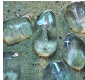
Ice cubes melting