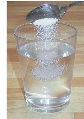
Solution of sugar and water

When a solid ( solute ) dissolves in the liquid ( solvent ), a solution is formed.