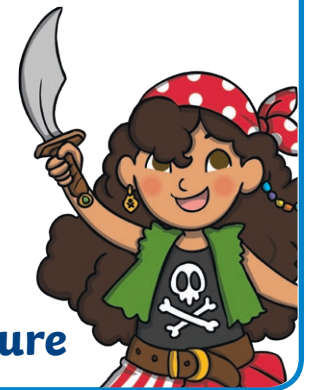
Pirate Jenny's Treasure

Challenge: What fraction of the treasure does Pirate Jenny get? _____