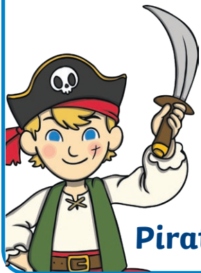
Pirate Jack's Treasure